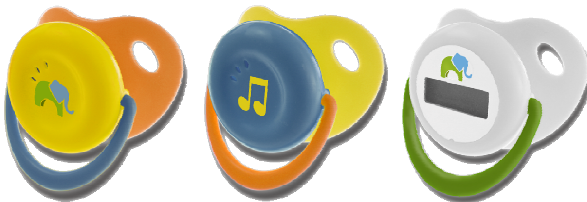
BP303 (Standard) / BP401 (Melody) / MP202 (Thermometer)